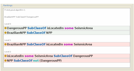
Fig. 4: RaMP: Axiom ranking display

The reasoning algorithms implemented by RaMP work in a similar way. They compute a ranking (ordering) of the axioms in the ontology and use this ranking to determine which axioms are more important than others in the ontology. The details of these algorithms will are provided in Sections 3.1 and 3.2 respectively. An example ranking is depicted below in Figure 4. The axioms appearing on the light pink background are defeasible axioms while the others are hard.